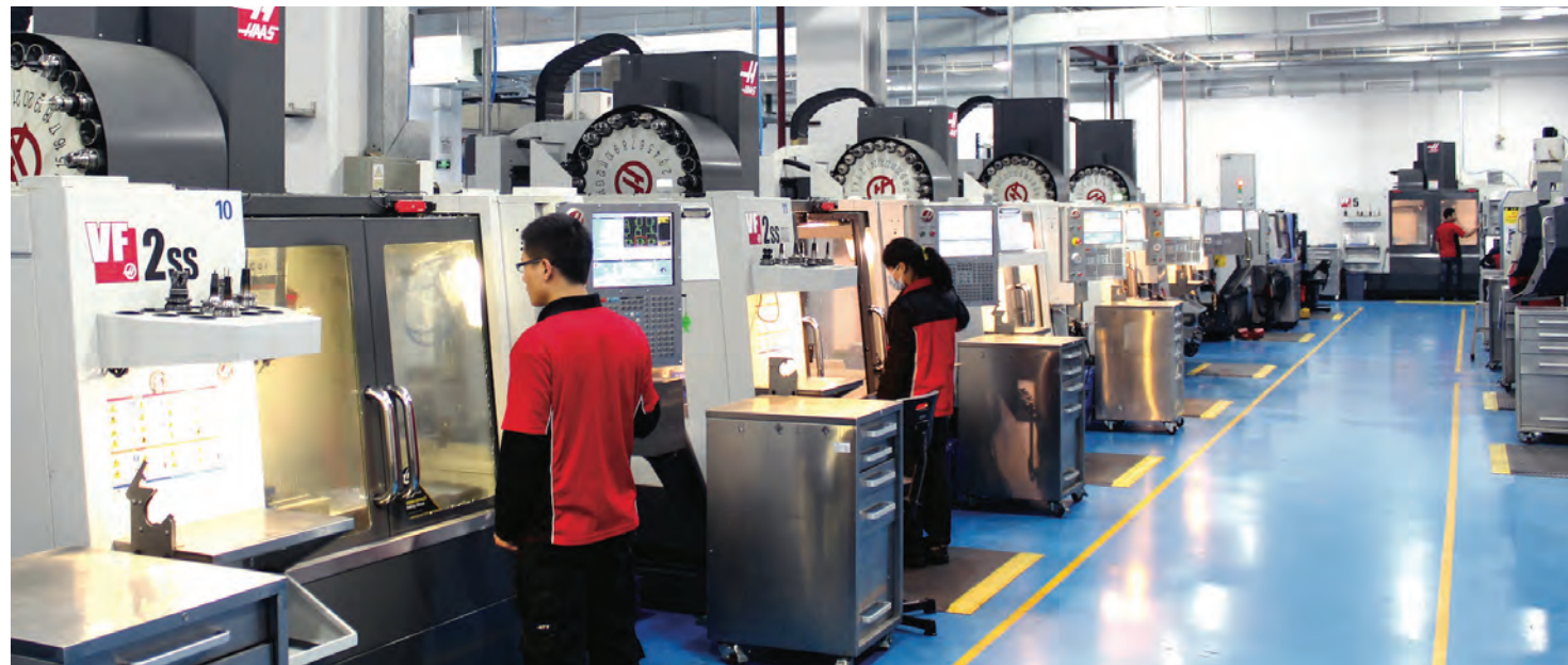
Opposite top | Inside Star Rapid's workshop in Guangdong Province, China Opposite bottom | A part produced using metal 3D printing Below | Star Rapid's quality control team at work